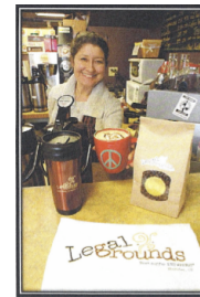
Legal Grounds Coffee Shop